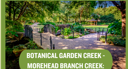
BOTANICAL GARDEN CREEK - MOREHEAD BRANCH CREEK: