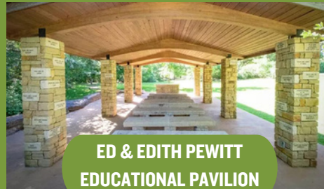
ED & EDITH PEWITT EDUCATIONAL PAVILION