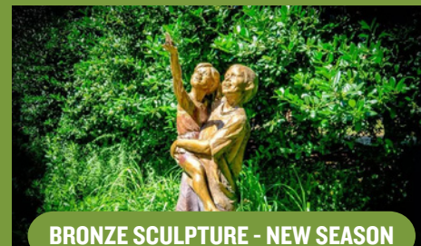
BRONZE SCULPTURE - NEW SEASON

Running through the Garden, this creek supports various wildlife and depends on seasonal rainfall.