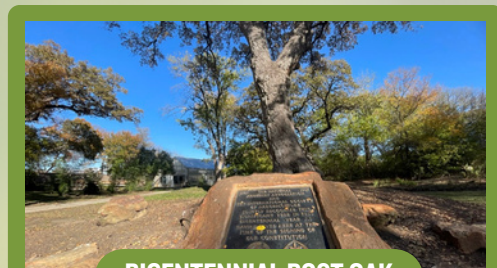
BICENTENNIAL POST OAK