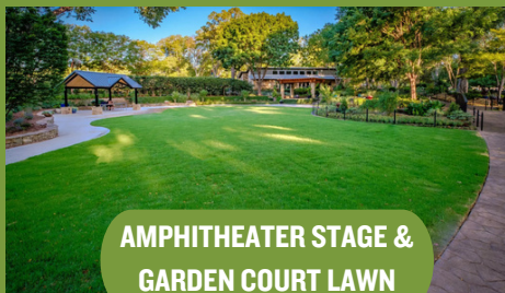
AMPHITHEATER STAGE & GARDEN COURT LAWN

Shaded by three Mexican Plum trees planted by the Grapevine Garden Club, this area is dedicated to symbolism, reflecting on the Oklahoma City bombing and 9/11 tragedies.